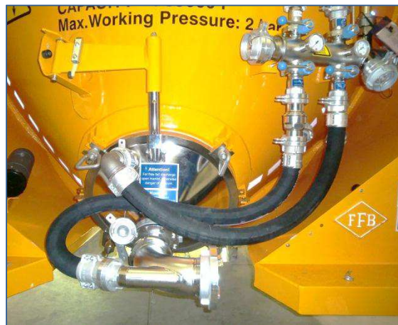
View with stainless steel fittings