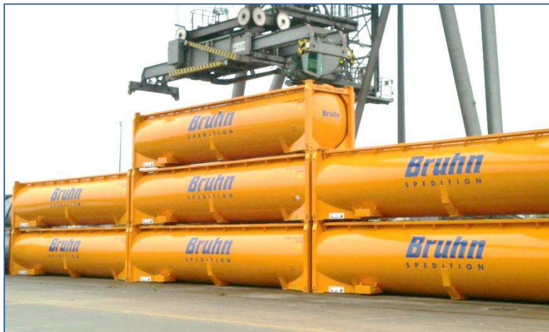
Pressurised Container ready for loading