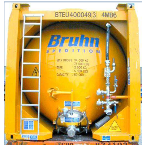
Stainless steel discharge valve and air connections